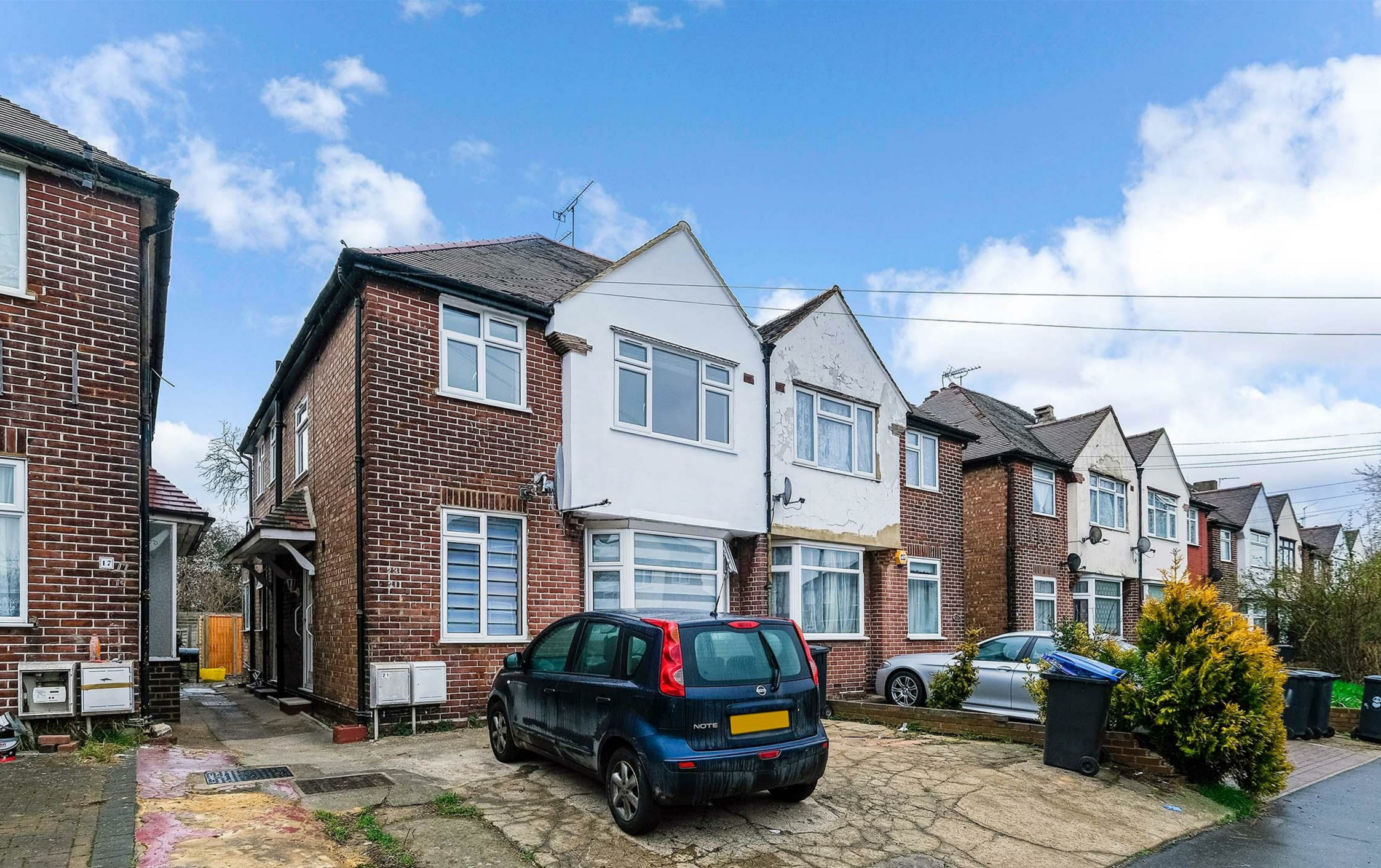
Sandhurst Road, Edmonton, N9 8BA